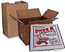
Cardboard & Pizza Boxes Flatten cardboard. Remove wax paper from pizza boxes