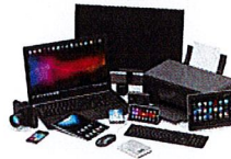
Electronics, Cords & Christmas Lights