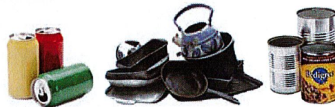
Aluminum Cans, Metal Cookware, Steel & Tin Cans