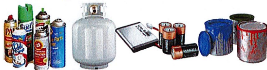
Aerosol Cans, Propane Tanks, Batteries & Paint Cans