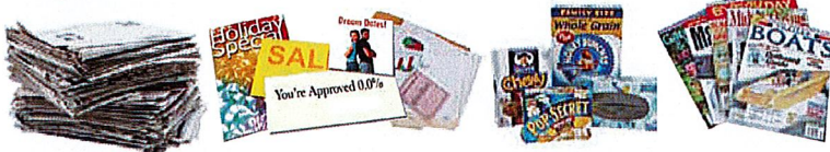
Newspaper, Office Paper, Paper Bags, Junk Mail, Paperboard & Magazines

Paper Place loose in cart. Use clear plastic bags for shredded paper ONLY .