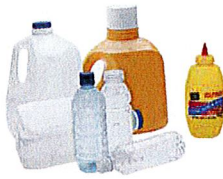
Jugs & Bottles with Small Top Openings