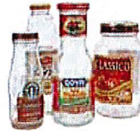
Clear Bottles & Jars